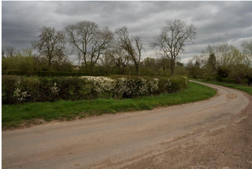
Carlton Ferry Lane by Paul Bass

Quiz answers: 1. Treasure Island 2. Kentucky 3. Lucy