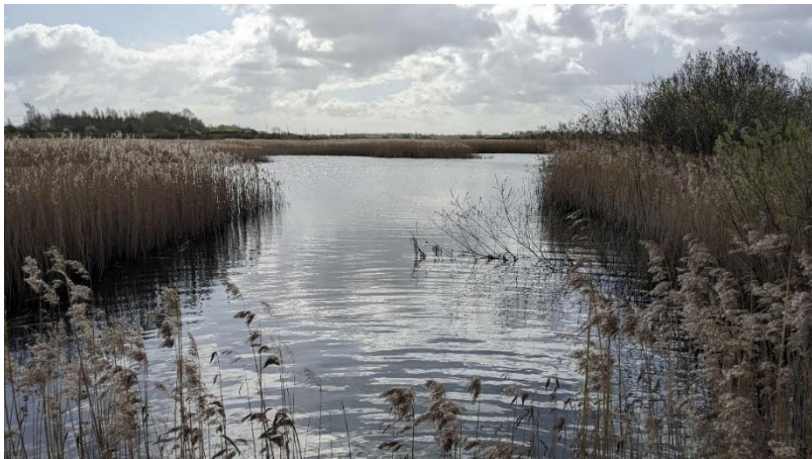
Langford Nature Reserve